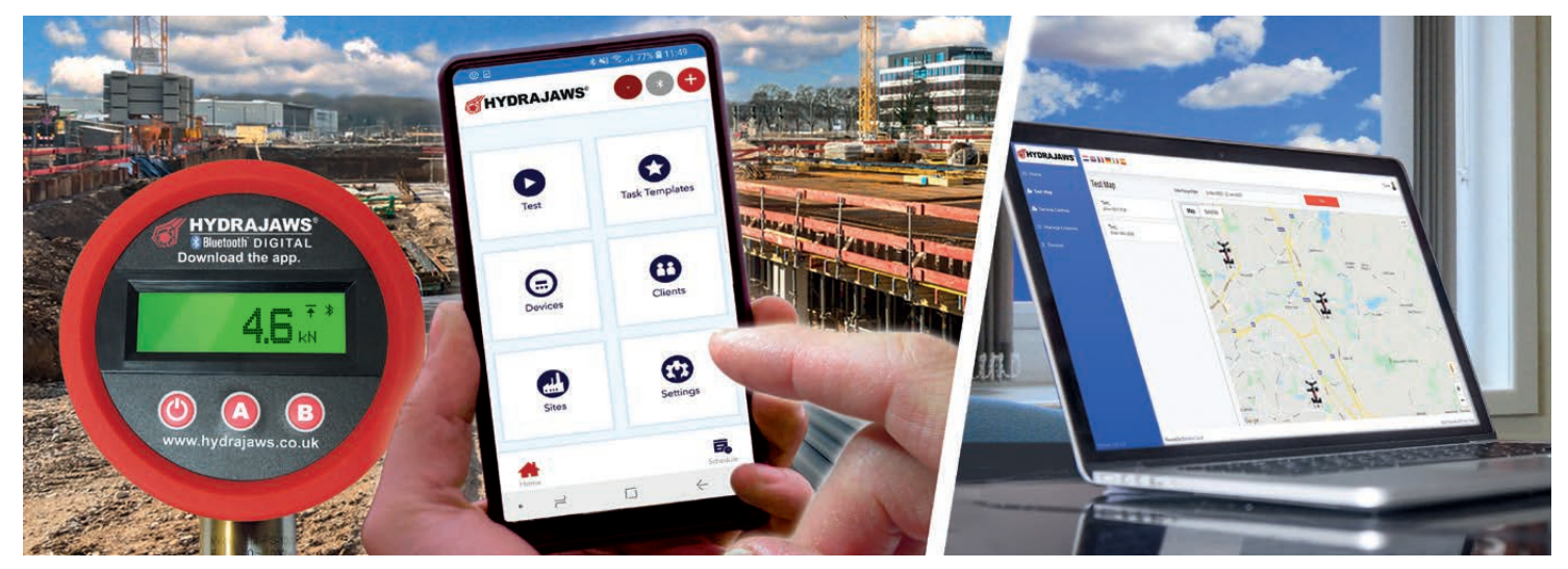
* Requires a monthly subscription. Gauge, laptop and mobile not included.

The Hydrajaws Bluetooth Digital system allows on-site pull tests to be automatically recorded and compiled into a digital report using the Hydrajaws Bluetooth Digital App on a mobile phone or tablet device. These reports can be sent directly to clients or managers and are stored in the cloud to be accessed remotely anywhere on a browser in a users own company dashboard.